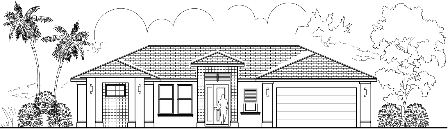
RESIDENCE FRONT ELEVATION