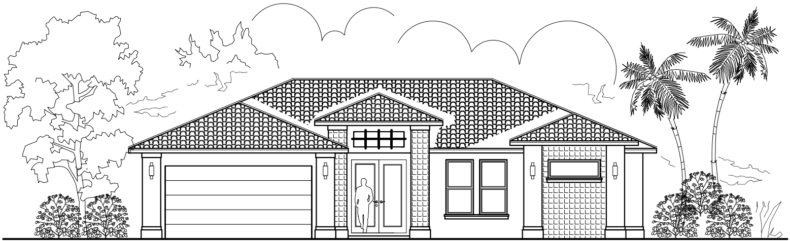
RESIDENCE FRONT ELEVATION