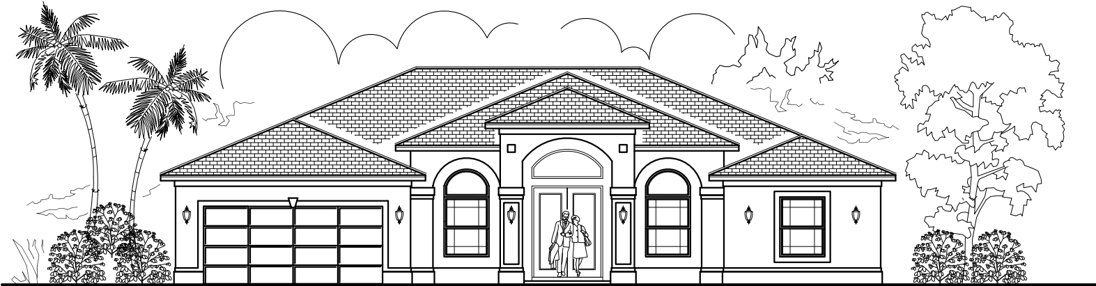
RESIDENCE FRONT ELEVATION